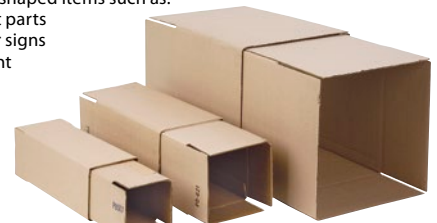
Priced per Box