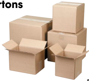
Priced per Box