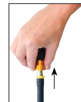
Slide the gold sleeve to release plug