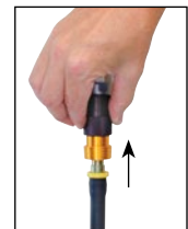
Slide the black sleeve to release downstream pressure