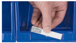
Inclined faceplate with removable label and protector