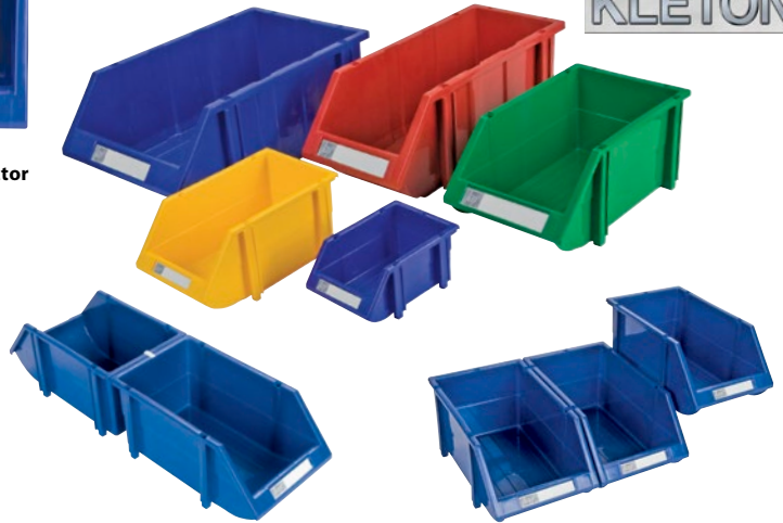
Connector clip allows for back-to-back mounting