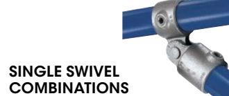
SINGLE SWIVEL COMBINATIONS