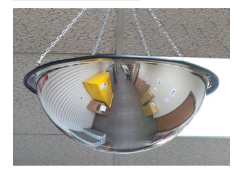
FULL DOME - 360°

USE FURNITURE POLISH TO CLEAN MIRRORS. GLASS CLEANER WILL DAMAGE SURFACE.