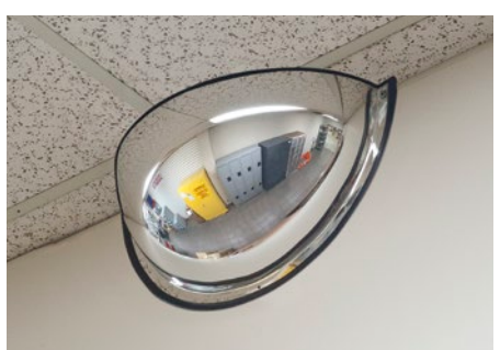
HALF DOME - 180°