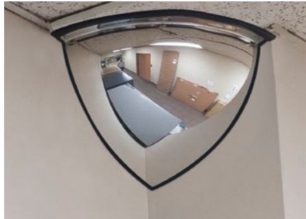
QUARTER DOME - 90°