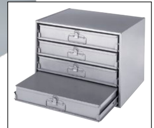
CA965 Cabinet and boxes sold separately