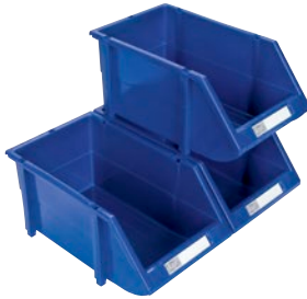
Stackable using built-in feet