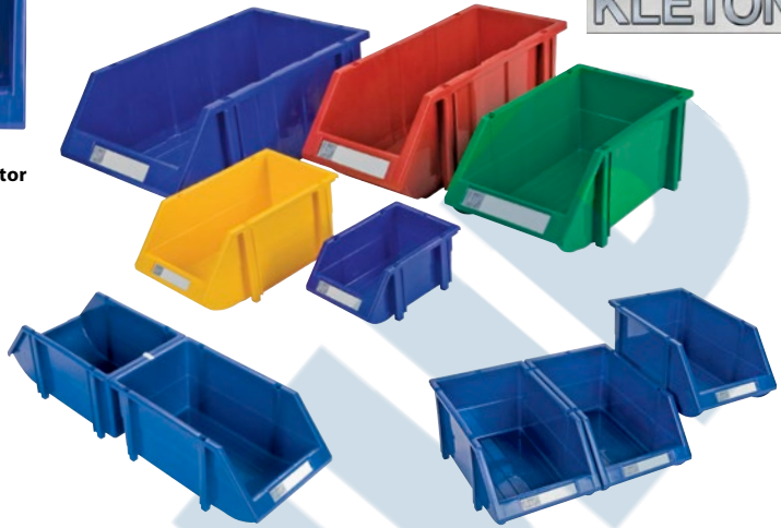
Connector clip allows for back-to-back mounting