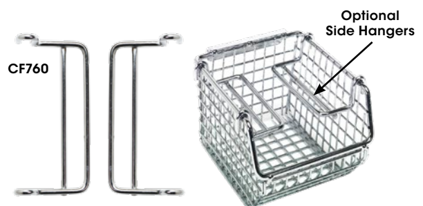
Optional Side Hangers