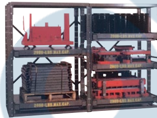
Starter & Add-on