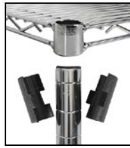
RL054 Split Sleeve