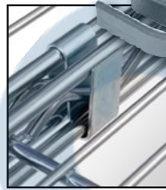
RL055 "S" Hook

Use S hooks to eliminate two posts per adjacent shelf. Two required per shelf.