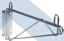
RL612 Single Shelf Support