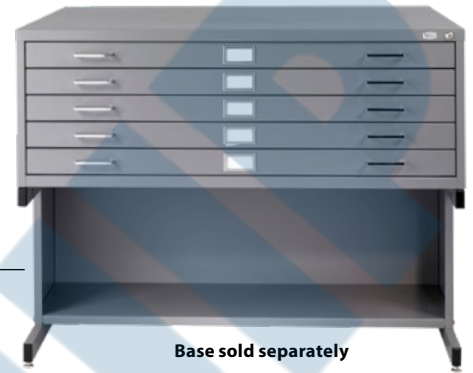
Base sold separately