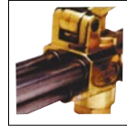
Brazed Triangular Tube Design