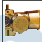
Protected Torch Union