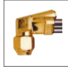
Solid Forged Head