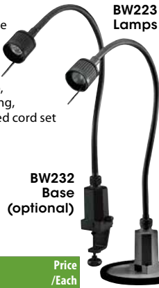
BW232 Base (optional)