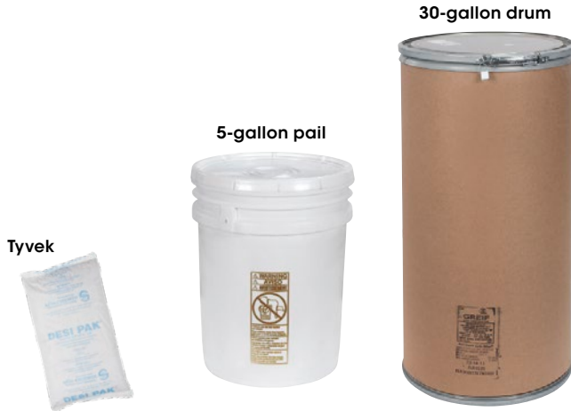
Priced per Package

Dust-free: Tyvek bags are ideal for applications where dust must be kept to a minimum. Examples include computer components, packaged chemicals, and photographic and optical devices.