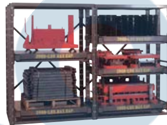
Starter & Add-on