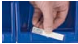
Inclined faceplate with removable label and protector