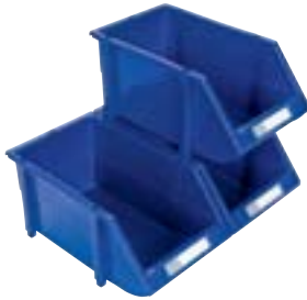
Stackable using built-in feet