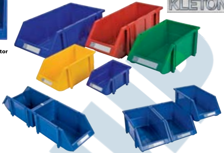
Connector clip allows for back-to-back mounting